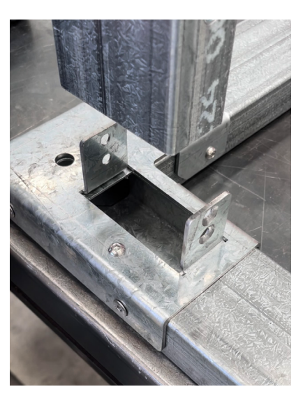
The picture shows how the corners are assembled through the 80x40 frame beam to achieve maximum stability.

Subframe finish: Pre-galvanized finish on all components