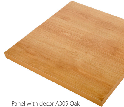
Panel with decor A309 Oak