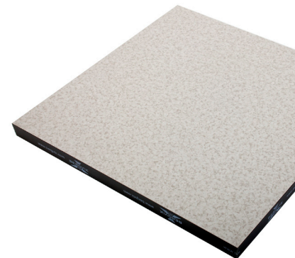
Panel with decor M335 Granite