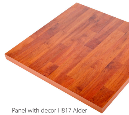
Panel with decor H817 Alder

Bergvik is an innovative knowledge company specializing in Raised floor systems and Seismic Bracing solutions tailored to our customer's applications.